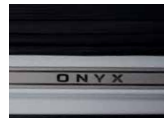
Onyx Inscribed Front Scuff Plates