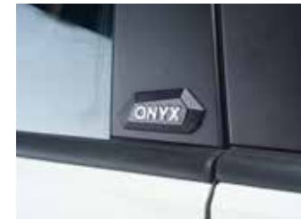
Onyx Badge on B-Pillar