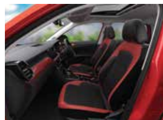
Monte Carlo Inscribed Ventilated Red & Black Front Leatherette Seats