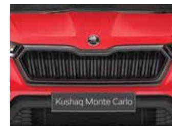
Škoda Signature Grille With Glossy Black Surround