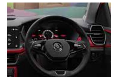
20.32cm Škoda Virtual Cockpit with Red Theme