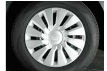
Steel Wheels R(16) + Wheel Cover, Tecton