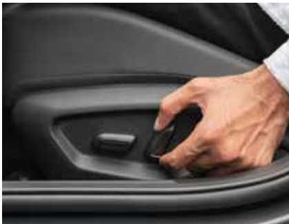
Electrically adjustable & Ventilated front seats.