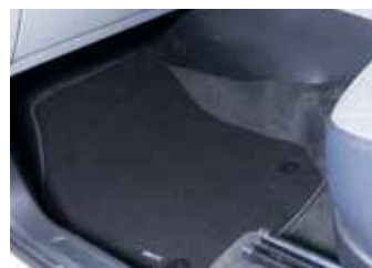
Premium Textile Mats