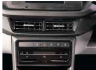
Climatronic Auto A/C