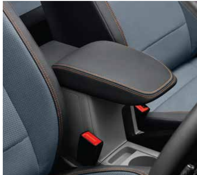
Storage In Front Centre Armrest