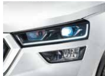
LED Head Lamp & Front Fog Lamp