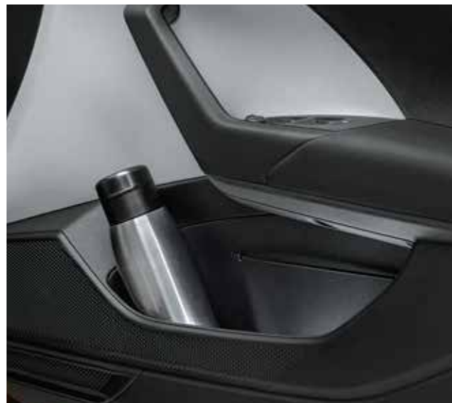
Storage In the Front and Rear Doors