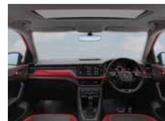
Red Ambient Lighting with Ruby Red Metallic Décor