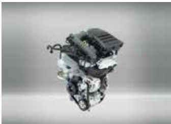
1.0 TSI Engine