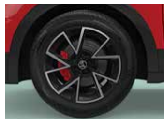
R17 Dual-tone Vega Alloy Wheels With Red Brake Calipers*