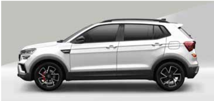
Monte Carlo - Candy White with Carbon Steel Painted Roof