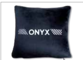
Memory-foam Cushion Pillows with Onyx Inscription