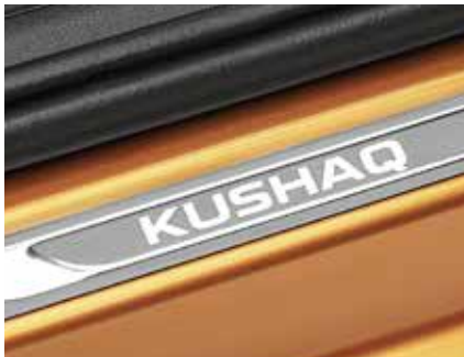
Scuff plates with Kushaq inscription

Begin your exploration enveloped in unparalleled comfort and space. Škoda's craftsmanship shines through its sleek black leatherette seats, offering an extraordinary premium escapade.