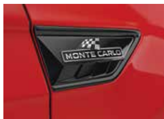
Monte Carlo Fender Garnish