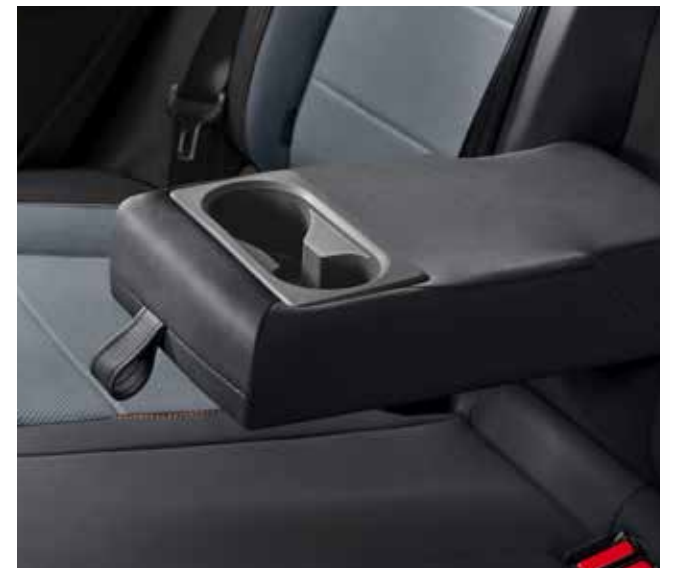
Cupholders In Armrest