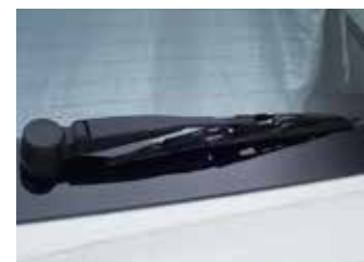
Rear Wiper & De-fogger