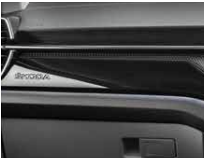
The ambient lighting in white color helps amplify the coziness