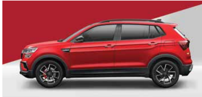
Monte Carlo - Tornado Red with Carbon Steel Painted Roof